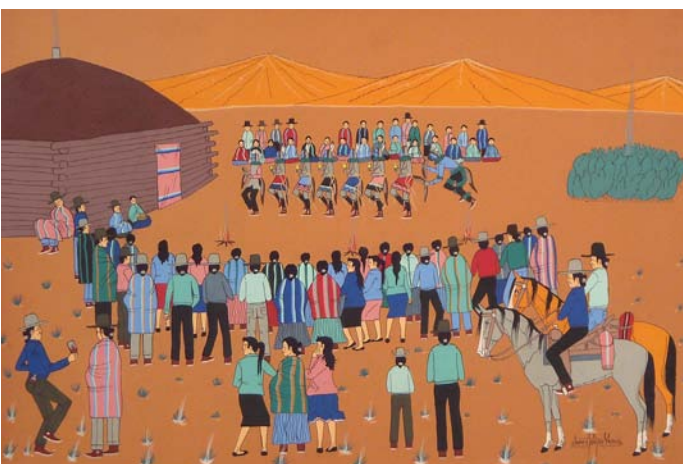
Top image: Ralph Roybal (San Ildefonso) Rainbow Dancers Faculty Office area (3rd floor)

The cultural practice of Native American ceremonies and rituals is believed to bring order and balance to the tribal community and, by extension, the world. Images that depict aspects of these ceremonies and rituals are often filled with the nuances of indigenous cultural aesthetics reflective of tribal beliefs and customs. For many communities, the beauty of the dance can be seen in the affective visualization of the step – serving as synecdoche, or a part representing the whole, for both the physical dance and the accompanying rhythm and beat of the drum or singer's voice. Participation in ceremonies perpetuates the dynamic nature of tribal cultures, extending the life of the culture through its active practice, and provides a means for tribal members to affirm their individual identities. Tribal artists may opt to document a particular event or they may choose to depict the essence of the ceremony through abstraction. The range of images presented in this theme reiterate the importance of these cultural practices for both participant and viewer. These images of ceremony and ritual are also the place where Indigenous artists are most likely to depict the human figure, necessary as the activating force centrifugal to the event pictured.