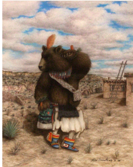
Left image: Ernest Whitehead (San Carlos Apache) The Pubescent Girl Library, Circulation Stacks (2nd floor)